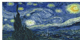
Starry Night Vincent Van Gogh 1889

In France that represented both an extension of Impressionism and a rejection of that styles inherent limitations. 20th century.