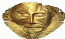
Mask of Agamemnon Heinrich Schliemann 1550-1500 B.B.

There are few remaining examples with early art often favoring drawing over color. Work has been found recently in tombs. Egyptian Frescoes, pottery, and metalwork.