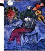
1947 Marc Chagall The Blue Violinist

This movement was used to show the emotion and responses that the subject gives the artist instead of the light of the impressionistic style. Characteristics: distortion, exaggeration, primitivism, and fantasy