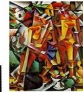
Georges Braque Popova: Two Figures (1913-1914)