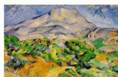
Mont Ste Victoire Paul Cezanne 1885-1889

Late 19th-20th centuries. Revolt against the conservative values of realism. Traditional forms of art.