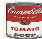
Campbell's Soup Andy Warhol 1962

Direct descendant of Dadaism in the way it mocks the established art world by appropriating images. Celebrate everyday objects such as; sop can, washing powders, & coke bottles.