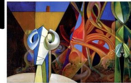
Max Ernst - Design in nature, 1947 - Oil on canvas - 59.8 x 66.7 cm - The Herli Collection, Houston, Gift of Alexander Solas

Emphasised the role of the unpredictable in art. characterised by a spirit of anarchic revolt.