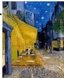
1892 Cafe Terrace at Night, Vincent Van Gogh

This movement rejected the limitations of light and nature of impressionism. The characteristics were still vibrant colors, but they had more freedom and defined forms with short brush strokes of color.