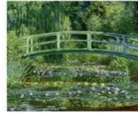
1897-1899 Claude Monet Water Lily Pond

It was started to move away from the religion dominated middle ages and turn to show the individual man. Defining Characteristics: political stability, economic growth and cosmopolitanism