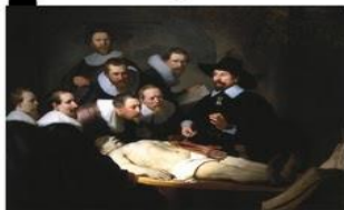
1632 Rembrandt Anatomy Lesson of Dr. Tulp

Characteristics: more realistic and emotionally affecting.