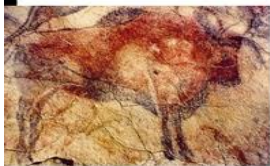
Around 15000 B.C.

15000 B.C. Favors drawing over colors. Very little is left.