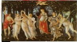
Primavera 1478 Sandro Botticelli