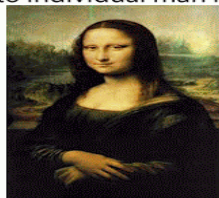
Mona Lisa Leonardo Da Vinci Circa 1503-1519

Began in Italy, 14th century. Individual Expression, & Wordly Expirience. Move away from religion, dominated middle ages, and turn to individual man in society.