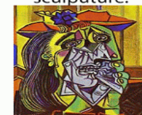
Weeping Pablo Picasso 1937

20th century. Avantgarde art movement, objects are broken up, analyzed, and re-assembled in an abstracted form. Revolutionized European painting and sculpture.