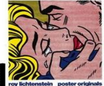
roy lichtenstein poster originals

broke traditional painting by rejecting a single viewpoint. Fewer and simpler forms, in brighter colors.