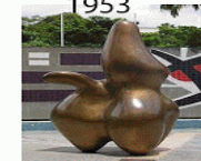
Cloud Shepard Hans Arp 1953