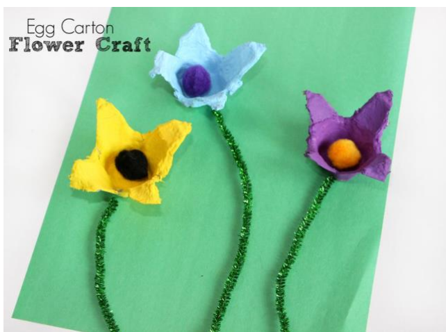
Flowers using egg boxes, pompoms and pipe cleaners