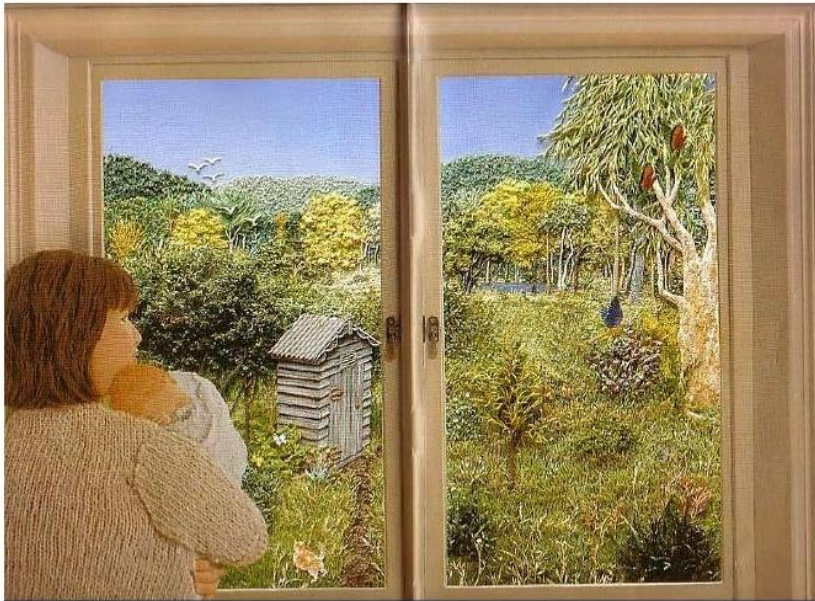
Picture 1 Window by Jeanne Baker

Year 2 After choosing your favourite view from the window, write a description of the setting telling me what you can see using either picture 1, picture 2 or picture 3. Remember to use lots of adjectives to describe what you can see.