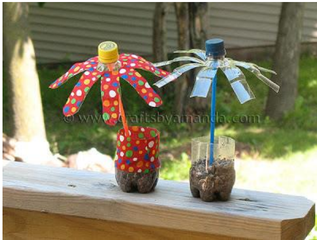
Trees using plastic bottles