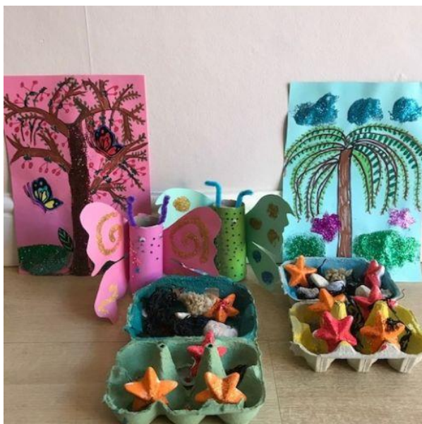
Willow Swain Myrtle Class Year 2