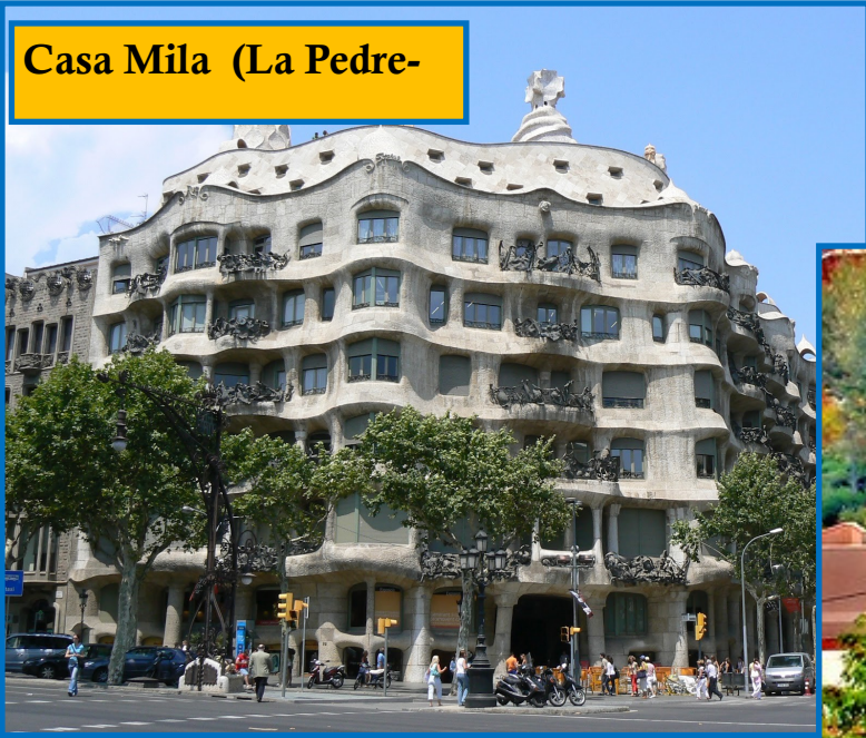
Casa Mila (La Pedre-

Here are some of Gaudi's famous buildings in Barcelona.