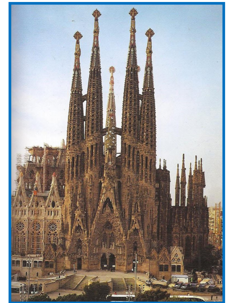
La Sagrada Familia