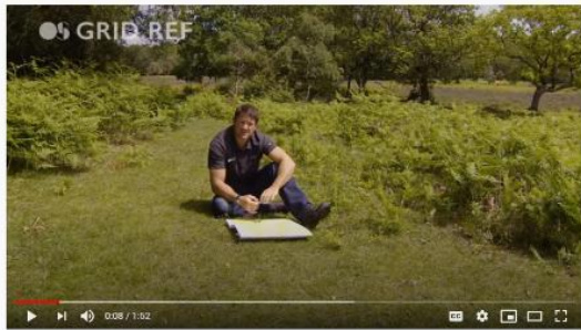
How to take a 4-figure grid reference with Steve Backshall and Ordnance Survey

These are linked to the National Grid which provides a unique reference system, and can be applied to all OS maps of Great Britain, at all scales. Great Britain is covered by grid squares measuring 100 kilometres across and each grid square is identified by two letters, as shown in diagram A.