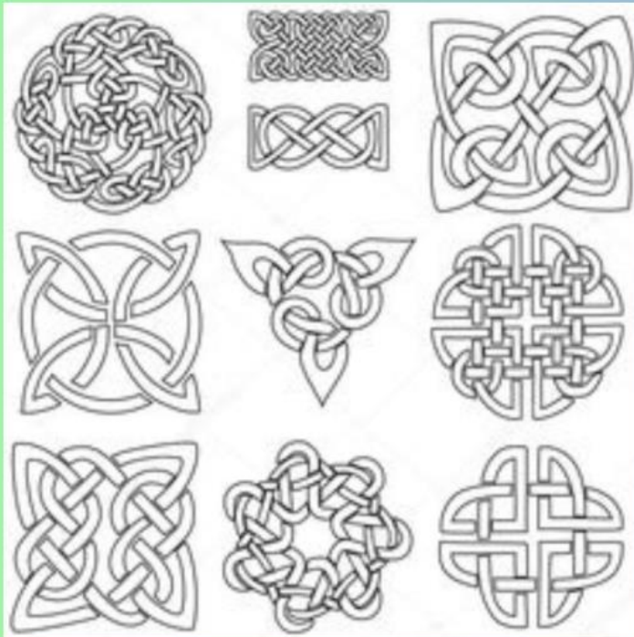
Celtic knot art work