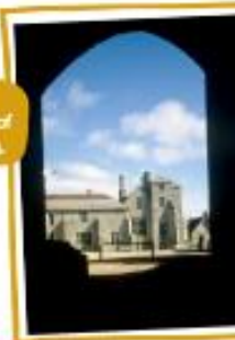
View through the gatehouse of the inner bailey.