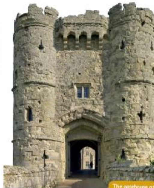
The gatehouse at Carisbrooke Castle

Complete questions A and B then move into the inner bailey.