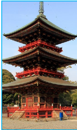
A Japanese Pagoda