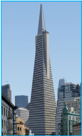
The Transamerica Pyramid - San Francisco

Study the buildings below. How might their shape and structure help them in an earthquake?