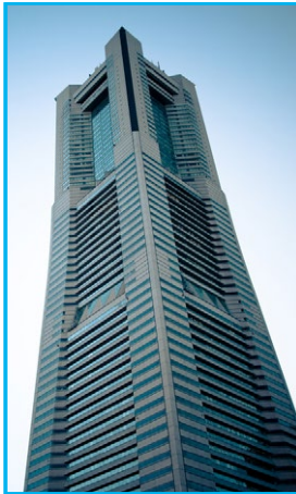
The Yokohama Landmark Tower - Japan