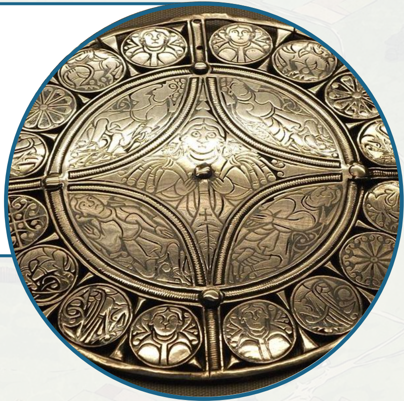
The Fuller Brooch – 9 th century Anglo-Saxon

Niello was a black paste made from copper, sulphur, silver and lead. It was added to the metal and then fired – heated to a very high temperature – to set the paste.