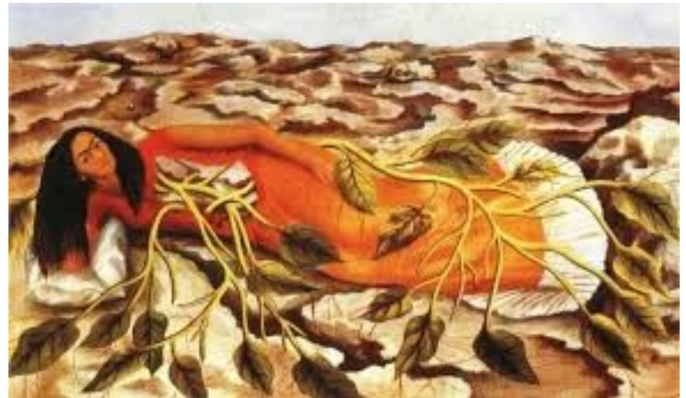
Roots (The Pedregal), 1943