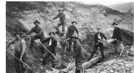
Men digging for gold during the Gold Rush