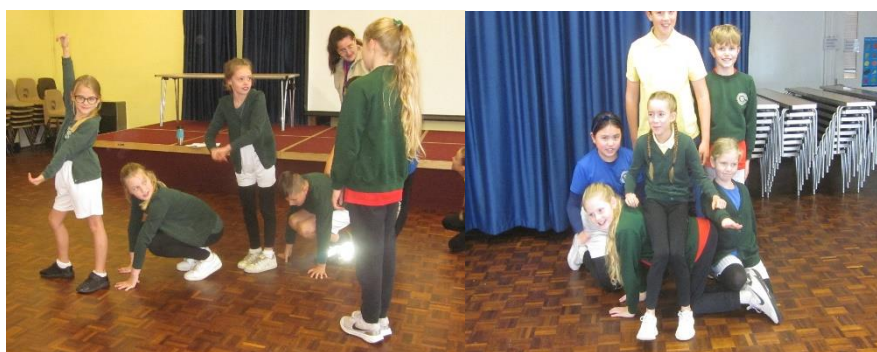
Creating a Chinese Dragon

YEAR 5/6 Last Monday, Year 5/6 had a Marvelous Middle to our current topic with a fabulous day of bringing history to life through drama. They experienced ensemble choral speaking, produced freeze frames and created dramatic interpretations of key moments in the Shang timeline. The children reflected on their own and each others' performances giving constructive critique of elements such as quality of dialogue, clarity of presentation and effective use of space. The children are now writing reviews of the day for possible use on the company website.