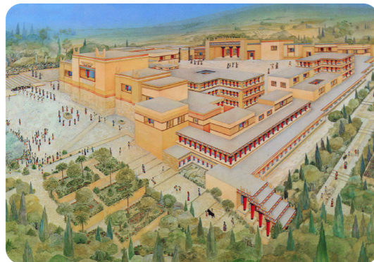
Reconstruction of the palace of Knossos

The Minoan civilisation existed between c3000 BC and c1100 BC on the Greek island of Crete. At the civilisation's peak, around 10,000 people lived in 90 cities. As Europe's first developed civilisation, the Minoans lived in towns with roads, wells and a basic sewerage system. They were capable farmers and skilled craftspeople. Their architects oversaw the building of palaces. They were also skilled in making pottery. They traded goods, such as olive oil, pottery and cloth. The Minoans also used an early writing system known as Linear A.