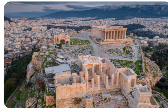
Aerial view of the Acropolis

The Classical period started in c500 BC and ended in 323 BC. It is known as the golden age of ancient Greece because many discoveries and advancements were made. People in the Classical period believed in gods and mythology from earlier periods, although philosophers and scientists at the time began to challenge those beliefs. Their architecture featured symmetrical designs and columns. Like the Minoans and Mycenaeans before them, people in Classical Greece established trade links both within Greece and with surrounding countries.