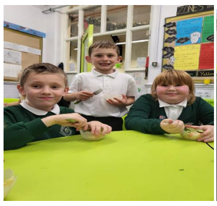
Year 3 and 4 Preparing Vegetable Pasta

Year 1 and 2 have been practising the nativity play and are really enjoying learning all the songs and dance moves. Thank you for sending in all the costumes so far. Monday is the absolute deadline for the last few but please let us know if you are having any difficulty with this. The children are looking forward to performing next week. It hasn't all been Christmas though, and year 1 are enjoying learning the names and positions of all the continents and Year 2 have been designing waterproof bunting.