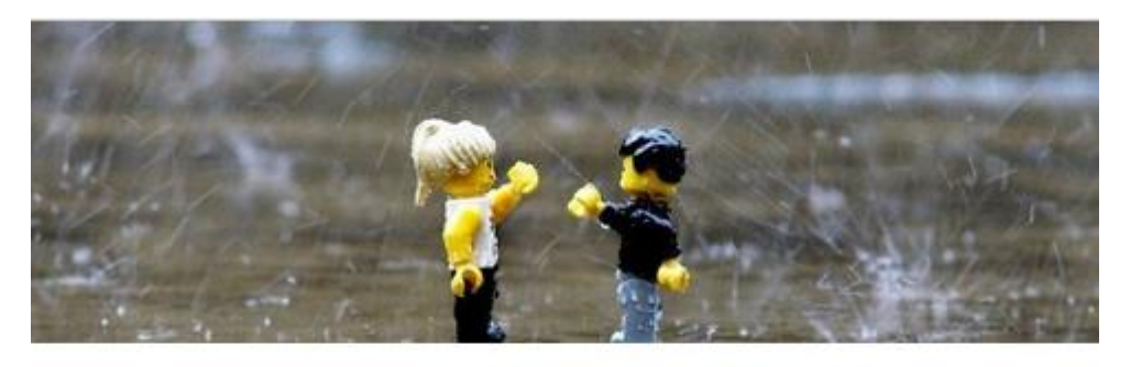
Keep Thriving Through Winter

With the long, dark nights and cold weather it is easy to start feeling down. You may feel more pressure with shorter days, but we have some great tips to help you.