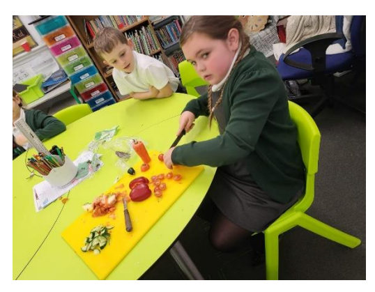
Year 5 and 6 Dynamic Dynasties Fantastic Finish Exhibition was held on Thursday afternoon. Here are some pictures from the event.