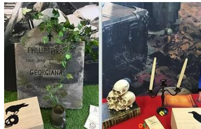
Some of the props from the Reading Escape Room coming to our school

There is so much to look forward to next term including our Wind in the Willows production.