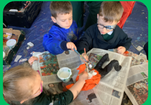
BGPS School Values