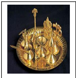
As well as worshipping in the mandir, Hindus worship at a shrine in the home.